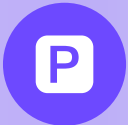
8 car parking spaces