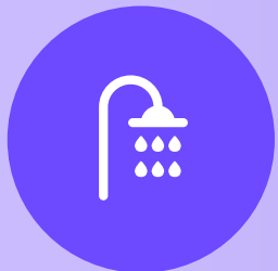
WC & Shower room