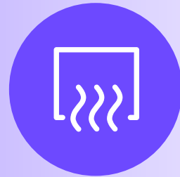
Comfort cooling 6 air changes per hour