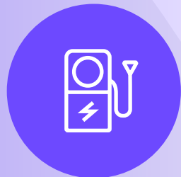
2 electric vehicle charging points