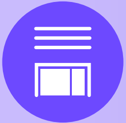
Laminate work benches (fixed and mobile)