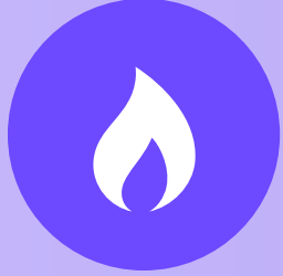
Gas pipework installed