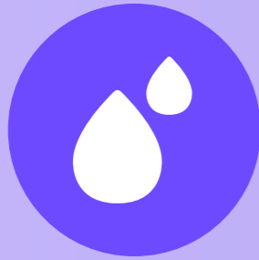
CAT 5 water installation