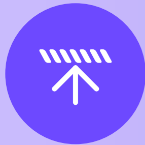
Raised access floors