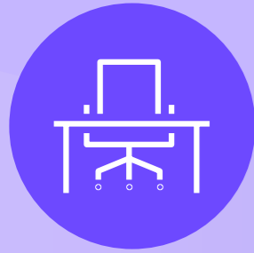
Fitted office accommodation