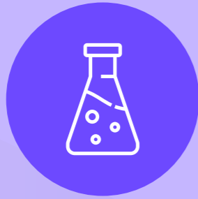
Fitted lab accommodation