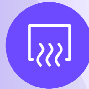
6 air changes per hour