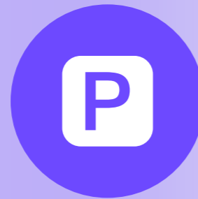
46 car parking spaces