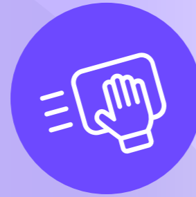
Wipeable ceiling tiles