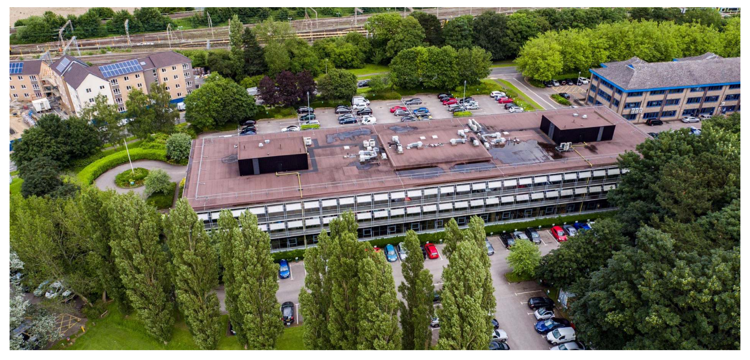
Challenge House is located next to the green and pleasant surroundings of Bletchley Park.

Challenge House is very accessible by road and public transport and there are plenty of amenities nearby.