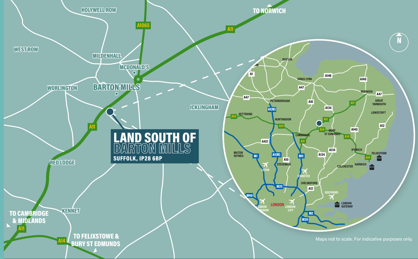
Maps not to scale. For indicative purposes only.

The site has recently been identified in West Suffolk Councils recent employment land review as having potential for a mixed commercial development.