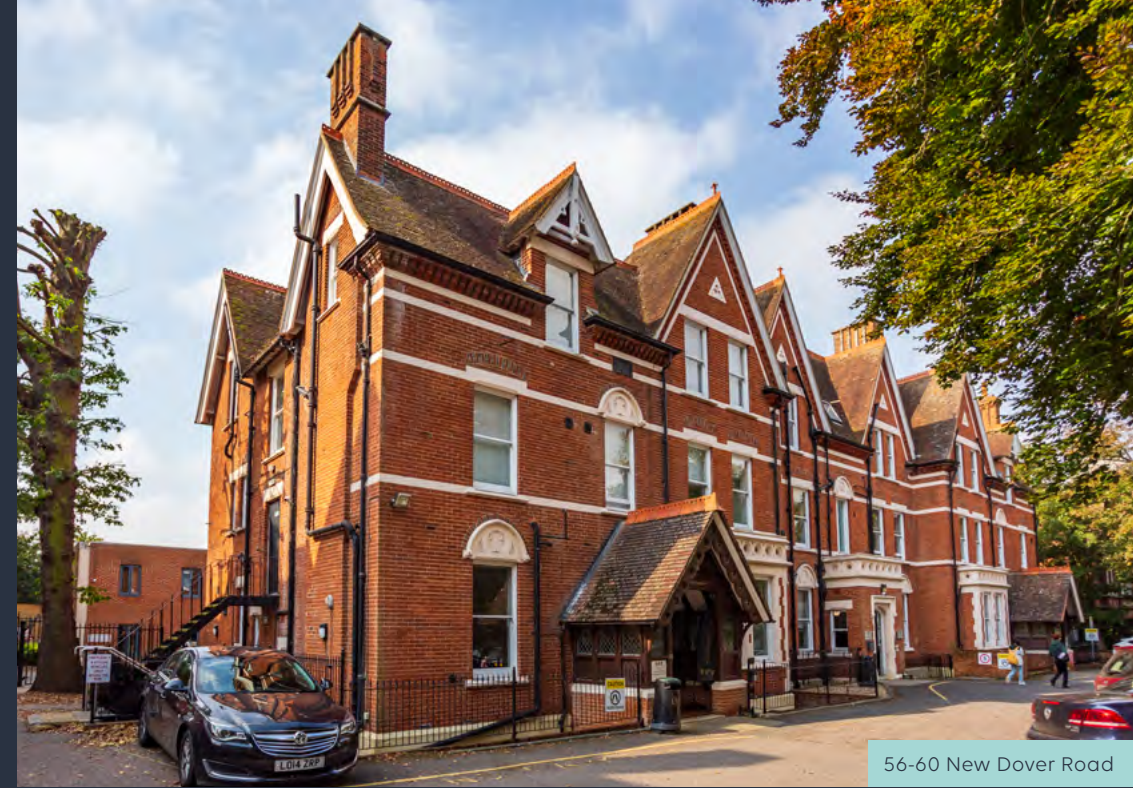
56-60 New Dover Road

Minimum reversionary yield of 6.10% (based on uplifts of 2% per annum) and maximum reversionary yield of 6.72% (based on 4% per annum) at the December 2027 rent review.