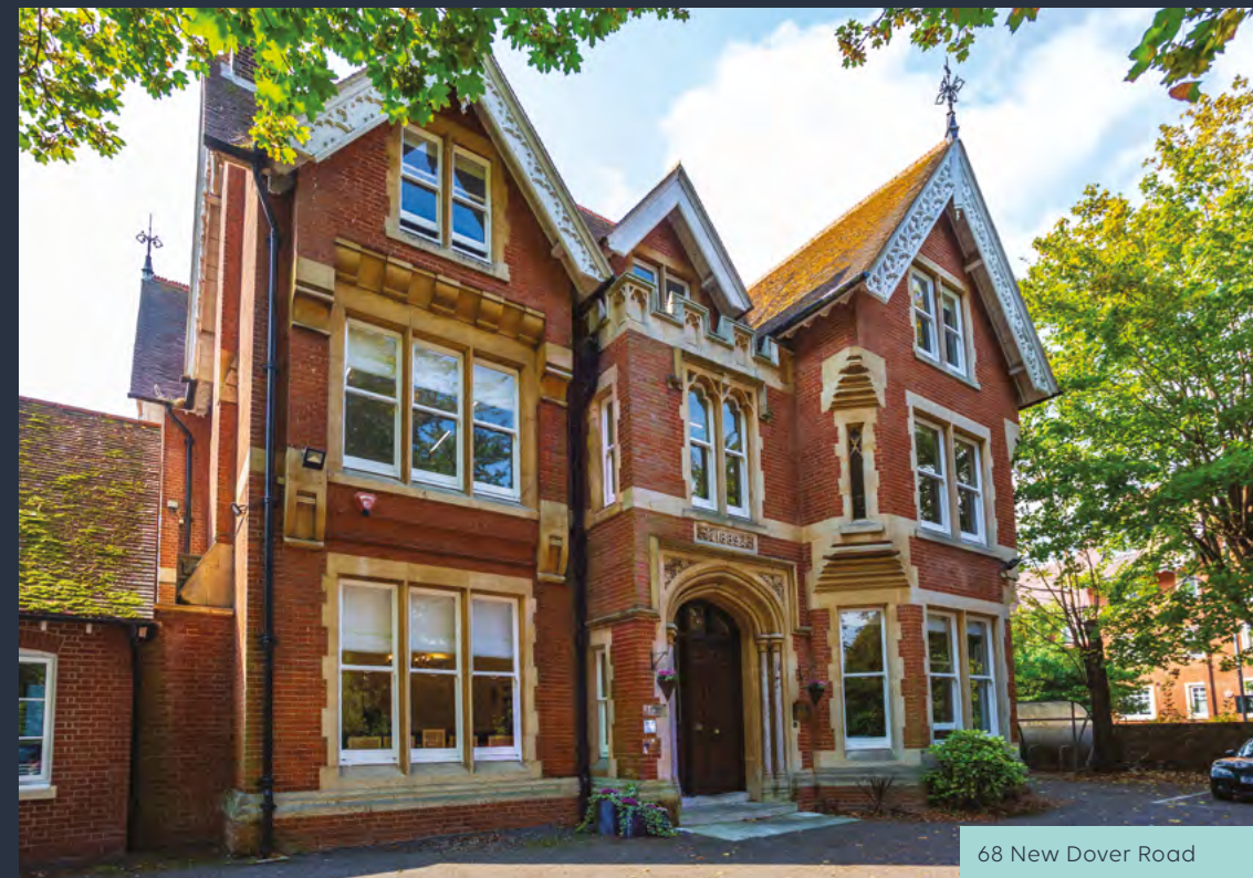
68 New Dover Road