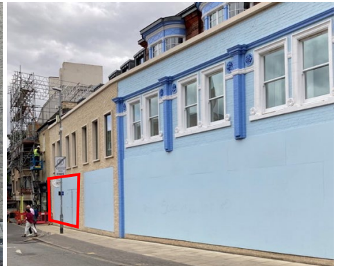
The unit's demise outline above is for indication only and is not the confirmed area.